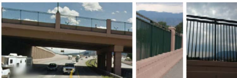
Picket Pedestrian Rail